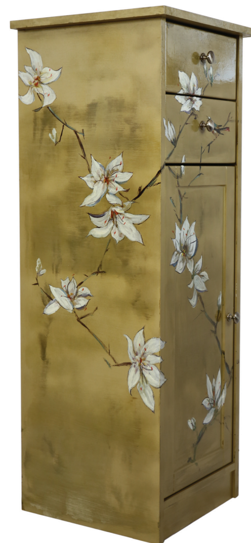
Magnolia and Eastern Bluebird Chest Drawer