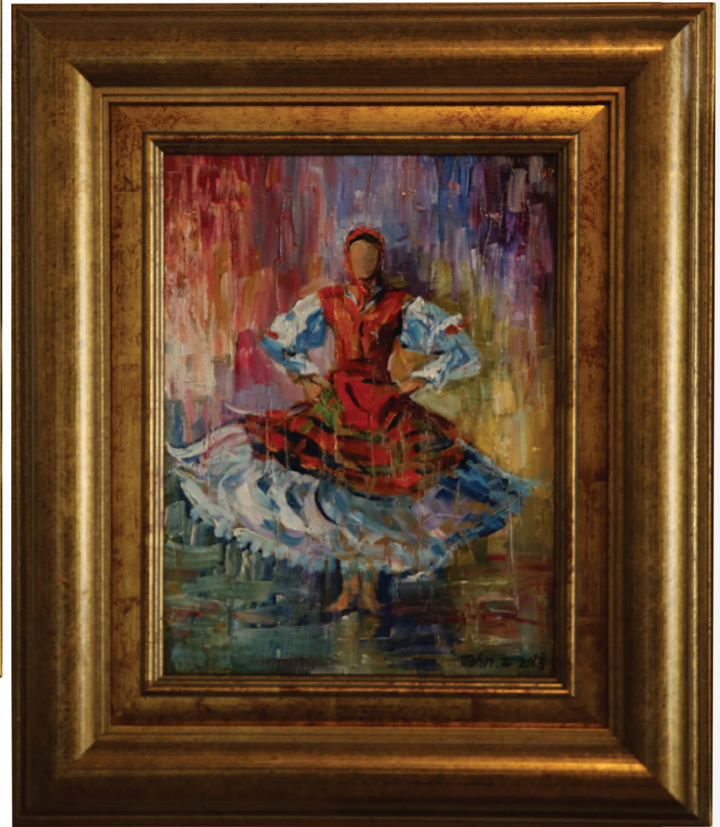
Maltese Dancers (Set of 2) 37 x 42, 40 x 47 (Incl. Frames) € 700