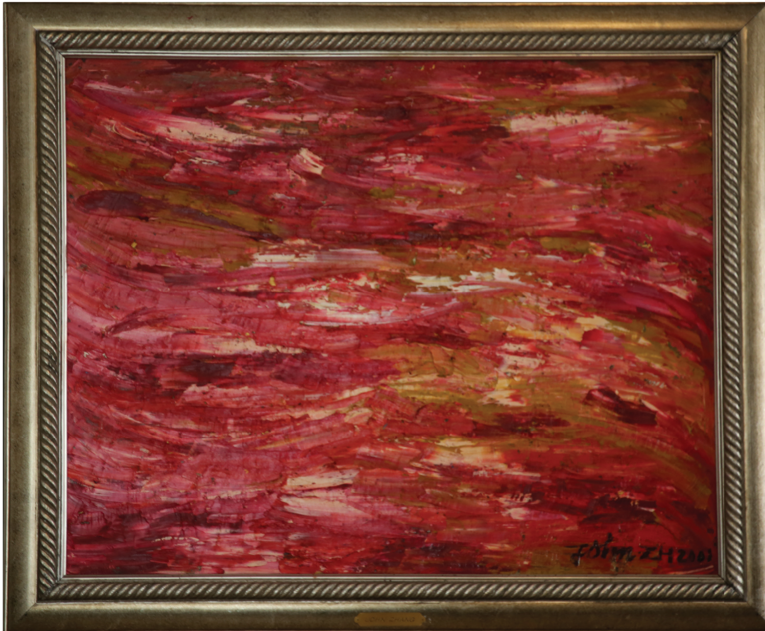
Red Sea 90 x 74 (Incl. Frame) € 900