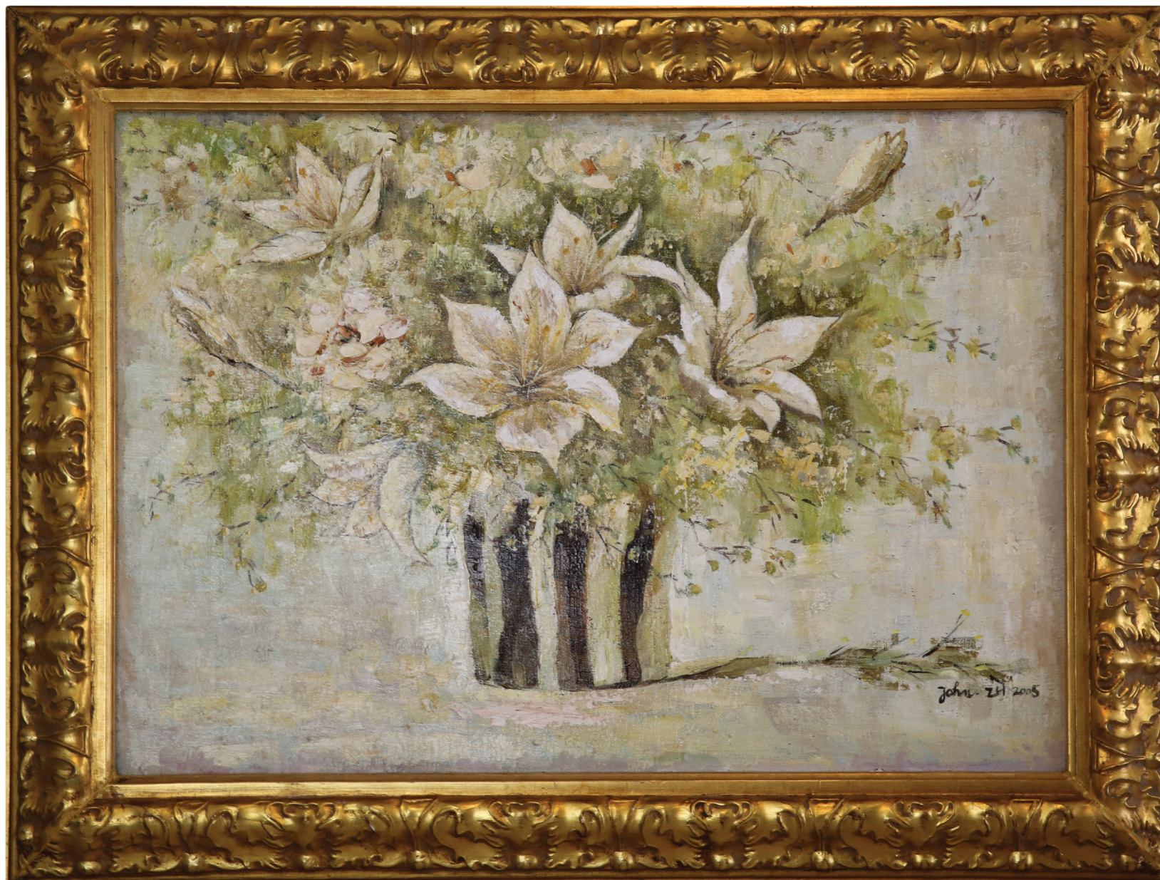
White Lilies 93 x 70 (Incl. Frame) € 1,200