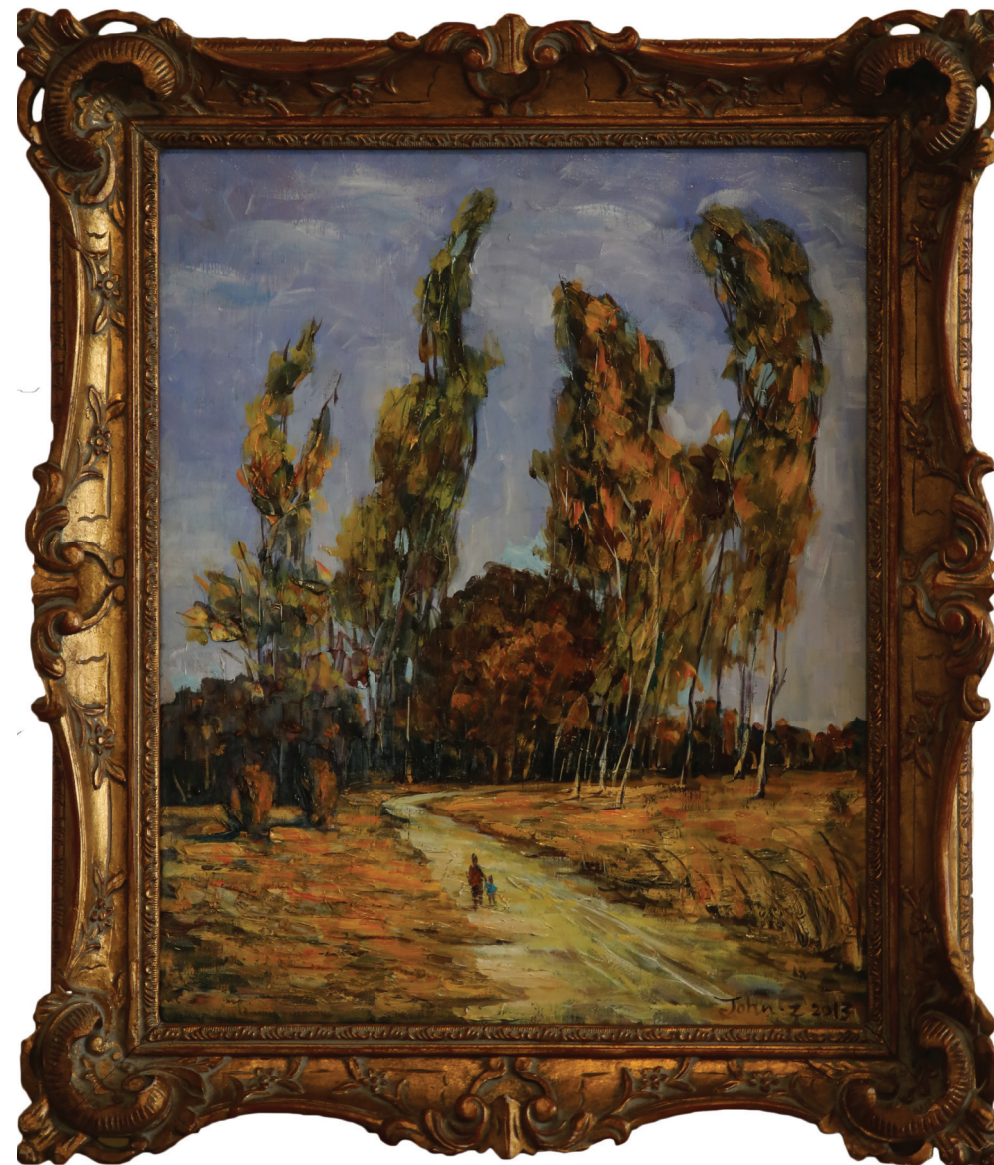
Golden Autumn 60 x 70 (Incl. Frame) € 900