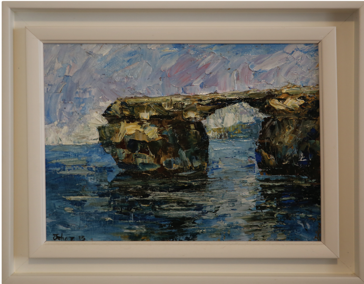
Azure Window 39 x 31 (Incl. Frame) € 400