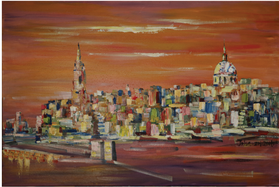
Valletta Impression I